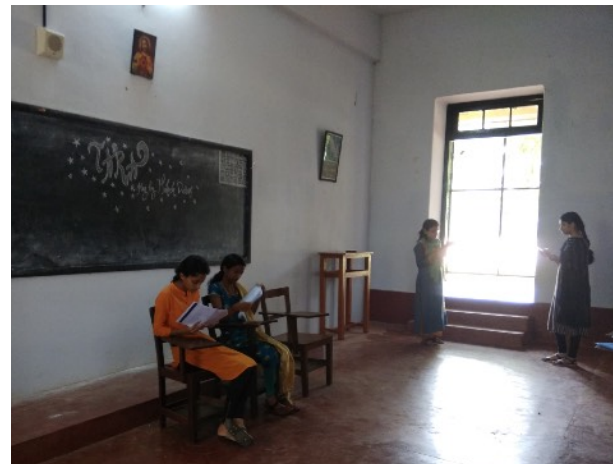
Production of Mahesh Dattani’s Tara