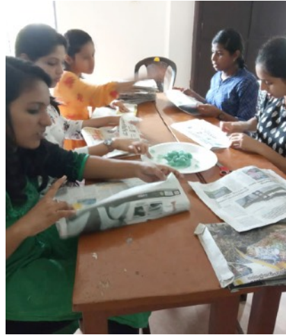
I BA students working at SUMAN rehabilitation centre