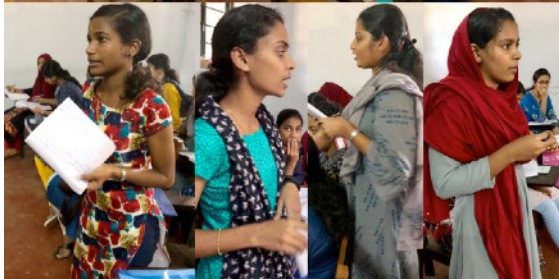
Debate on “Is Nehru the architect of modern India?” by PG students