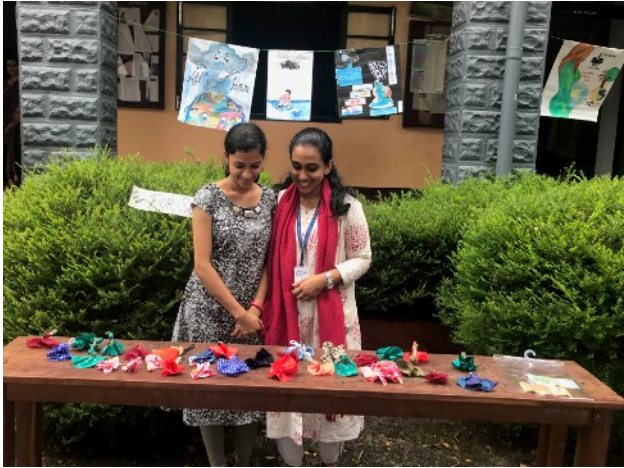
Exhibition and sale of Chekutty dolls