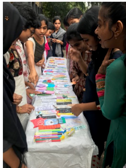
Literary bookmark exhibition and sale