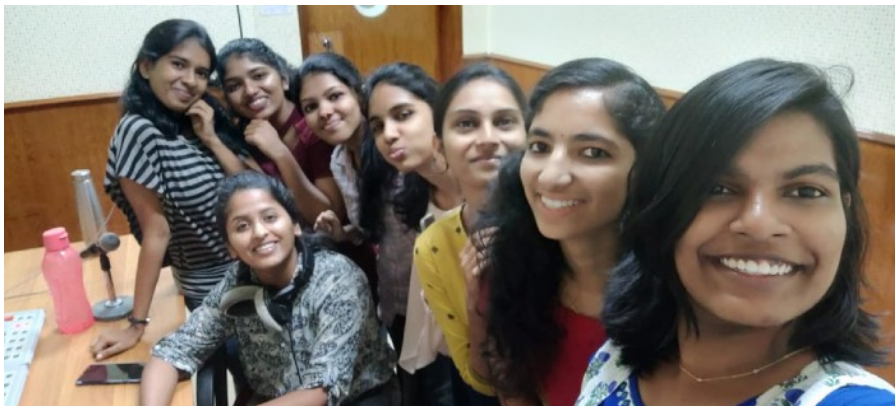
Students participating in Calling the Youth programme at All India Radio